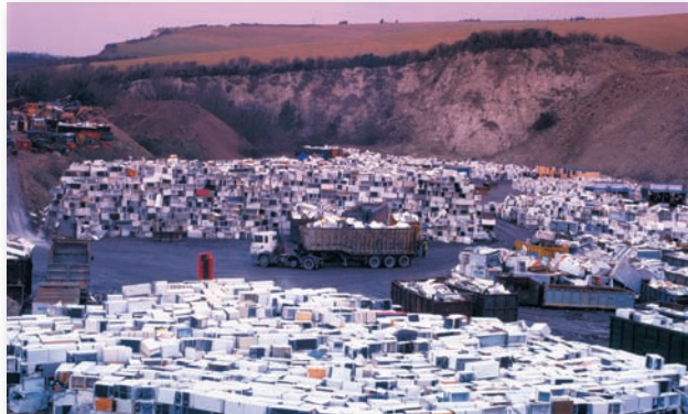
FIGURE 6-25 CFC-Containing Refrigerators